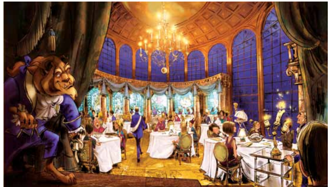
Below: Feast in the beautiful Ballroom of the Be Our Guest restaurant.