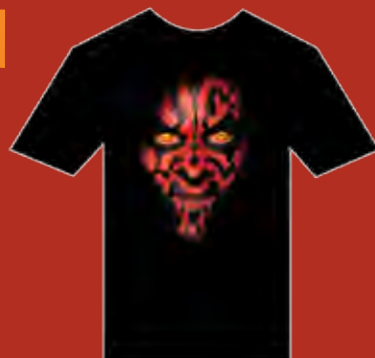
Men's & Ladies' T-shirts

Don't forget to use your Passholder discount for these exclusive goodies and more in the marvelous merchandise locale adjacent to Rock 'n' Roller Coaster® Starring Aerosmith at the end of Sunset Boulevard. This is so wizard!