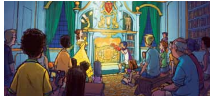
Left: Join in on the story during Enchanted Tales with Belle .