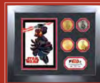
Framed Commemorative Coin Set