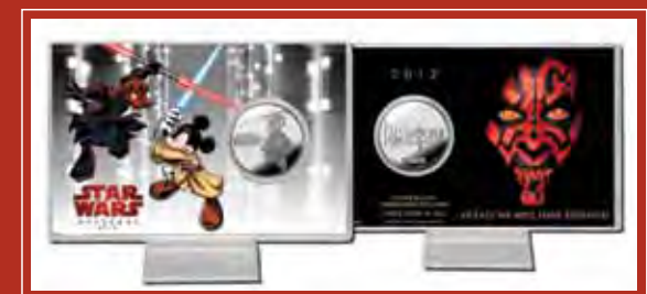
Two-sided Commemorative Coin