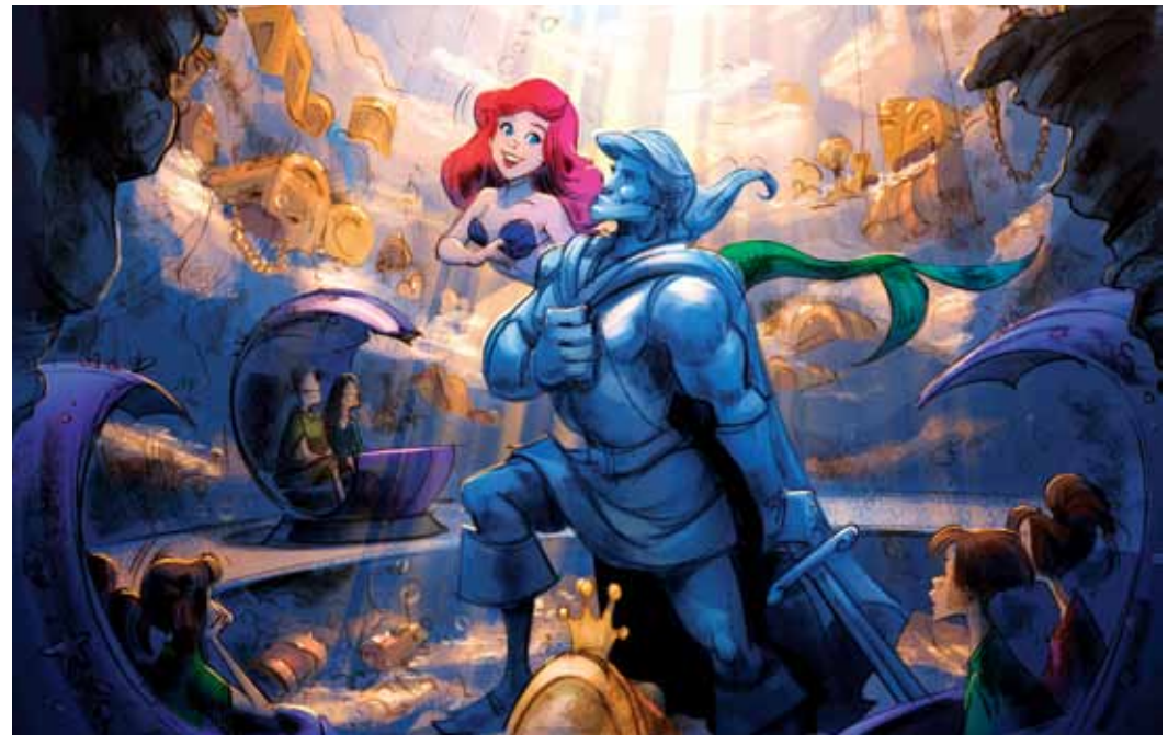
Above: Under The Sea~Journey of The Little Mermaid invites you to be part of Ariel's world.

And while in Beast's Castle, you can enjoy Quick-service dining by day and Table-service dining by night at the Be Our Guest restaurant. Here, an enormous mural in the main dining room will immerse you in the time and place of the Beauty and the Beast animated film. Walt Disney Imagineering artists created it first as a digital file and then projected it on the wall so scenic painters could bring it all to life: a fictional French valley where the stars are always twinkling and the snow is lightly falling.